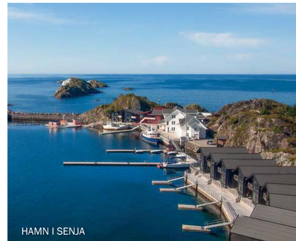
HAMN I SENJA

The combination of Arctic adventure and Aurora displays make this island a true Norwegian wonder that you have to see to believe.