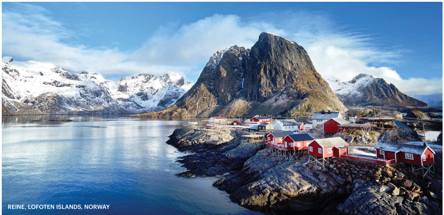
REINE, LOFOTEN ISLANDS, NORWAY

Solliveien in Tromsdalen up to the mountain ledge Storsteinen (421m above sea level) in the gondolas. From the viewing platform at the upper station, you can enjoy spectacular panoramic views of Tromsø and the surrounding islands, mountains and fjords. Make your way to the beautiful Senja , Norway's second largest island, located far above the Arctic Circle. Here you will be greeted by an awe-inspiring mix of sea, mountains, beaches, fishing villages and inland areas, all located within a few hours' drive. We will stay at Hamn i Senja , a holiday resort beautifully located on the west coast of the Senja island where the Northern Lights often display themselves by the sea. Tonight, choose to do an optional Northern Lights Husky Sledding activity. This magical experience will let you mush your own team of adorable huskies under the starry night sky. While here, you might also get a chance to witness the mysterious aurora borealis.