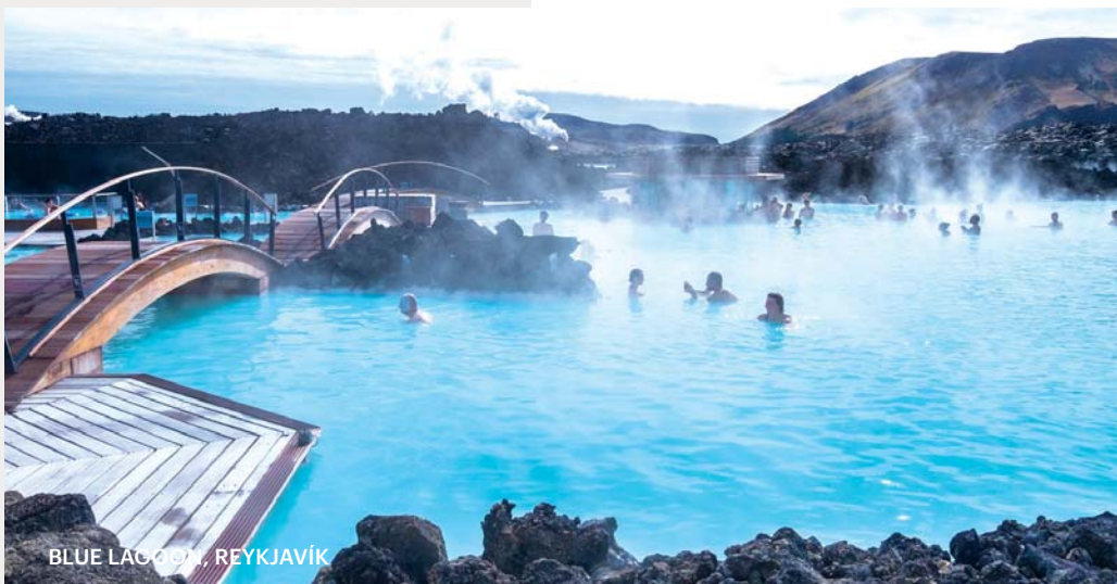
BLUE LAGOON, REYKJAVIK

Drive towards Vik, a picturesque town located on the most southern point of Iceland. The road to this place is a story for itself, from volcanic beaches to glacier and incredible stone formations. The city is located on a beach of black sand . You will