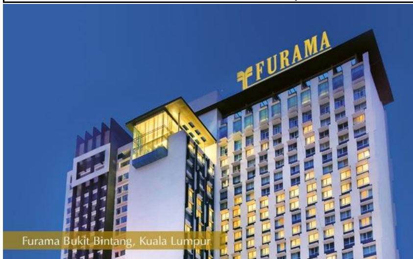
Furama Bukit Bintang, Kuala Lumpur