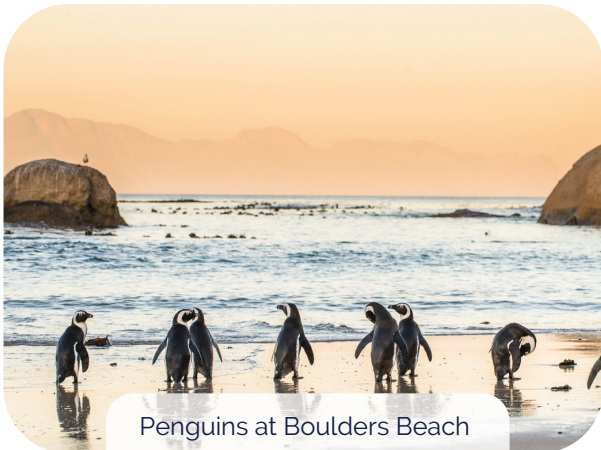
Penguins at Boulders Beach