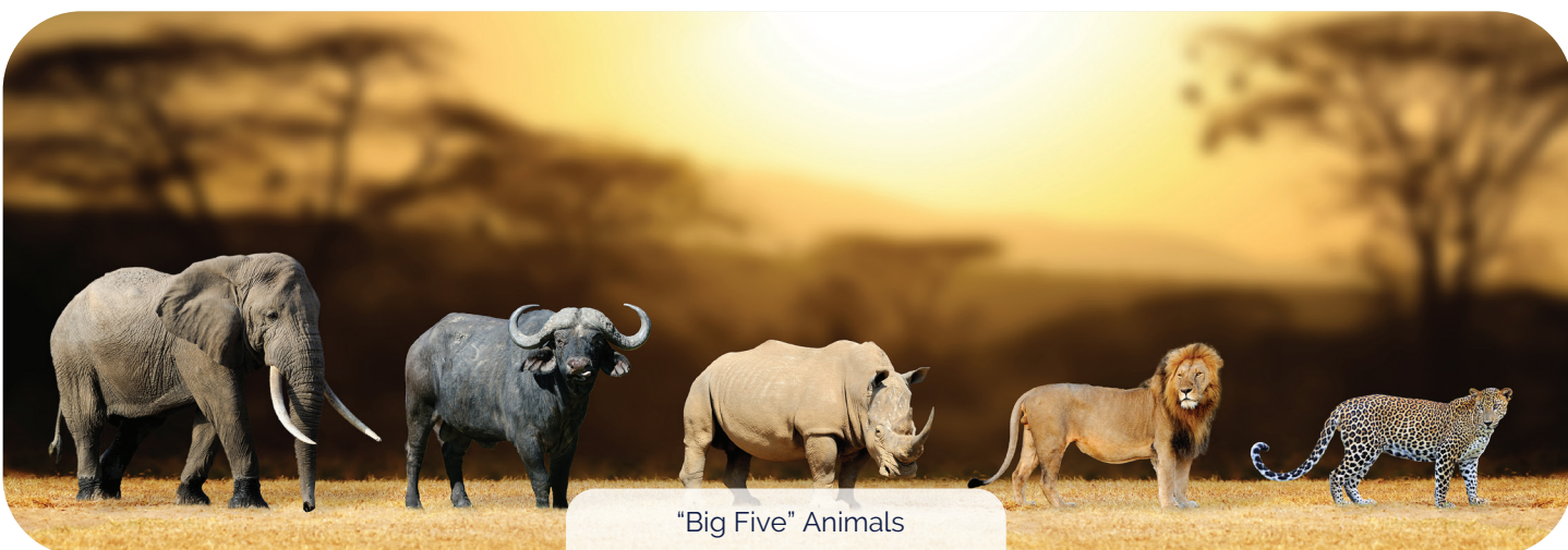
"Big Five" Animals