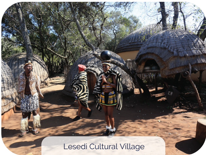
Lesedi Cultural Village