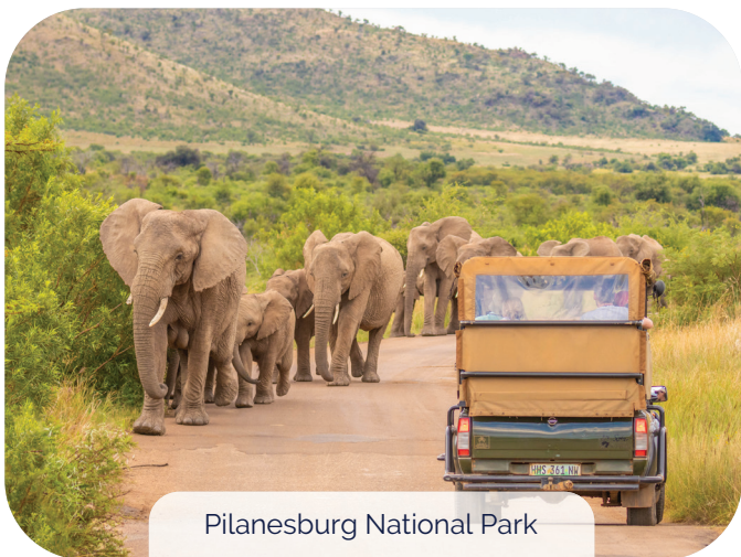
Pilanesburg National Park