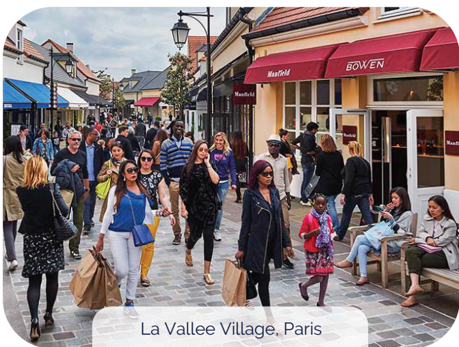
La Vallee Village, Paris