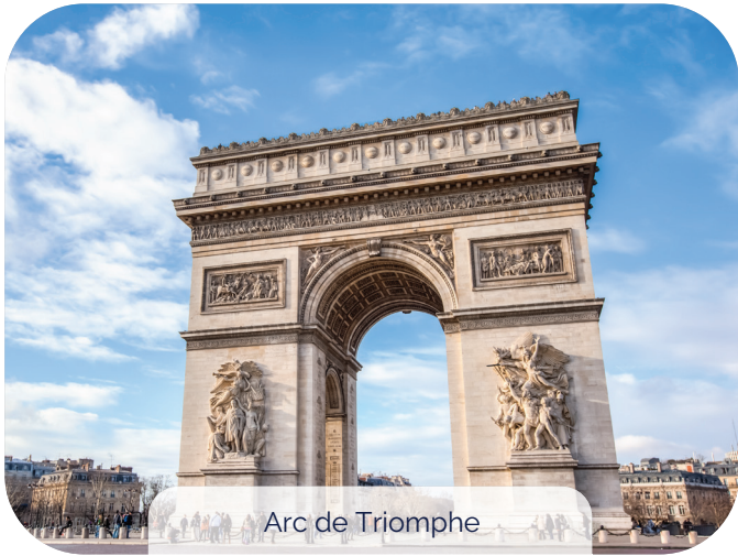
Arc de Triomphe