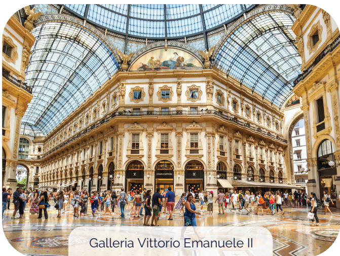
Galleria Vittorio Emanuele II