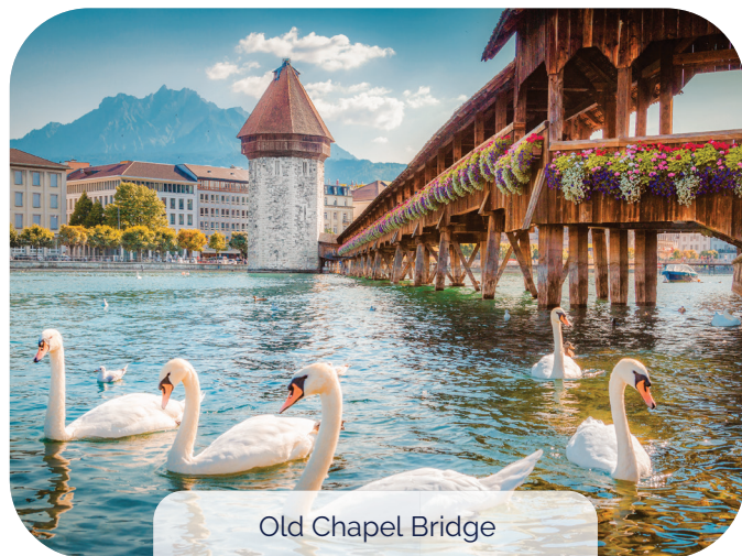
Old Chapel Bridge