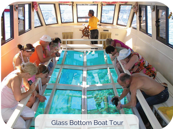
Glass Bottom Boat Tour