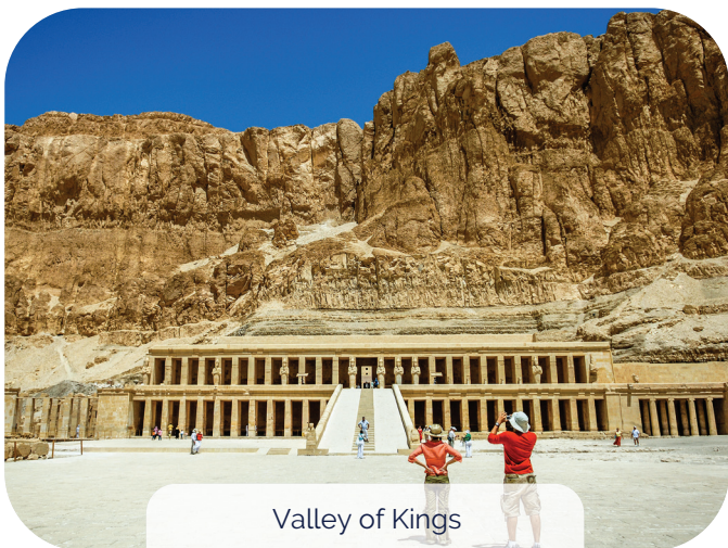
Valley of Kings