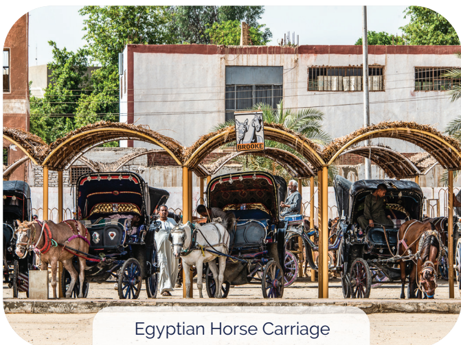
Egyptian Horse Carriage