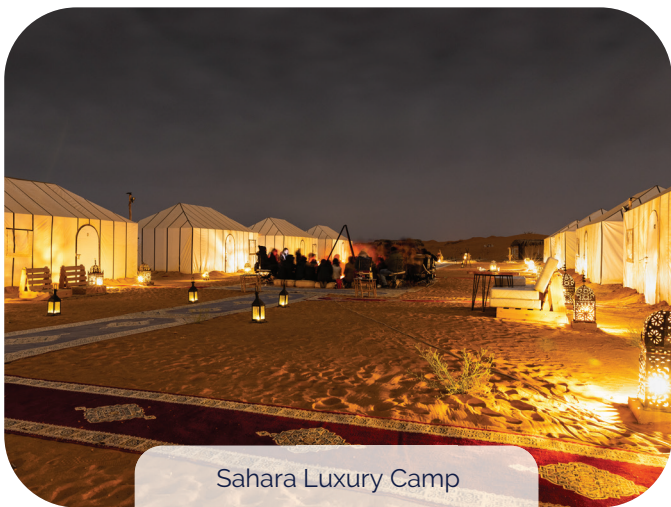
Sahara Luxury Camp