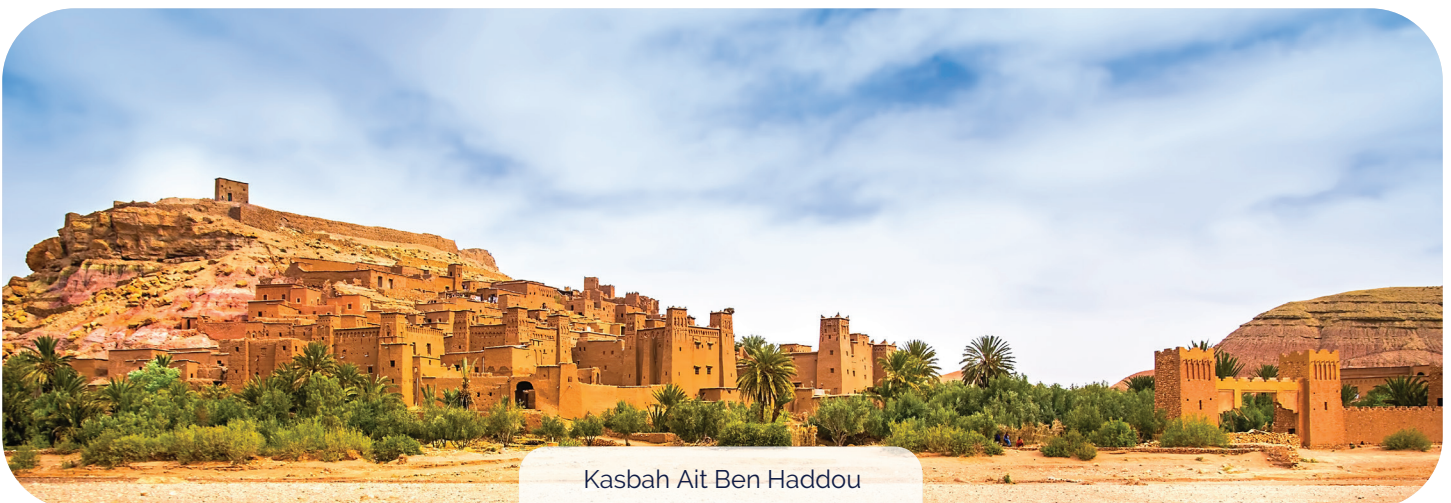
Kasbah Ait Ben Haddou