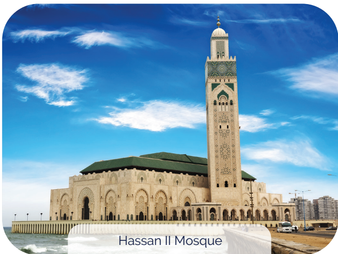
Hassan II Mosque