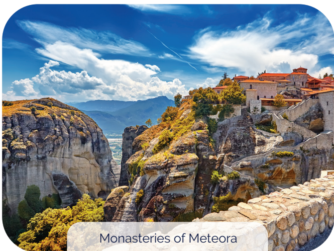
Monasteries of Meteora