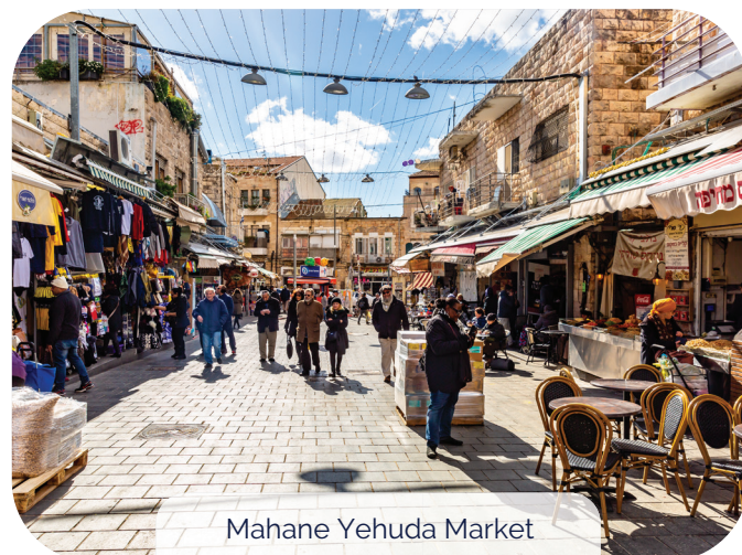
Mahane Yehuda Market