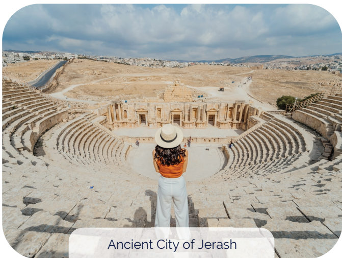
Ancient City of Jerash