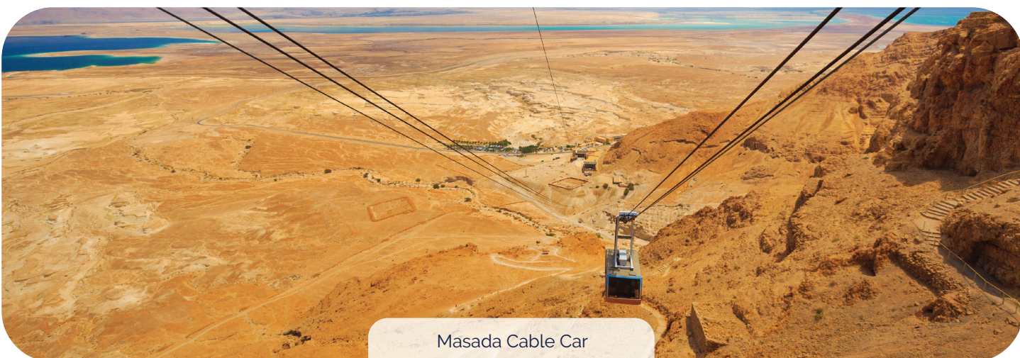
Masada Cable Car