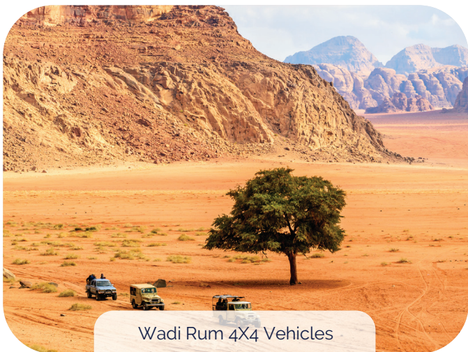
Wadi Rum 4X4 Vehicles