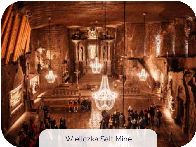
Wieliczka Salt Mine