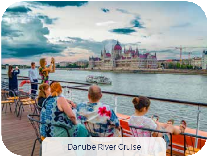
Danube River Cruise