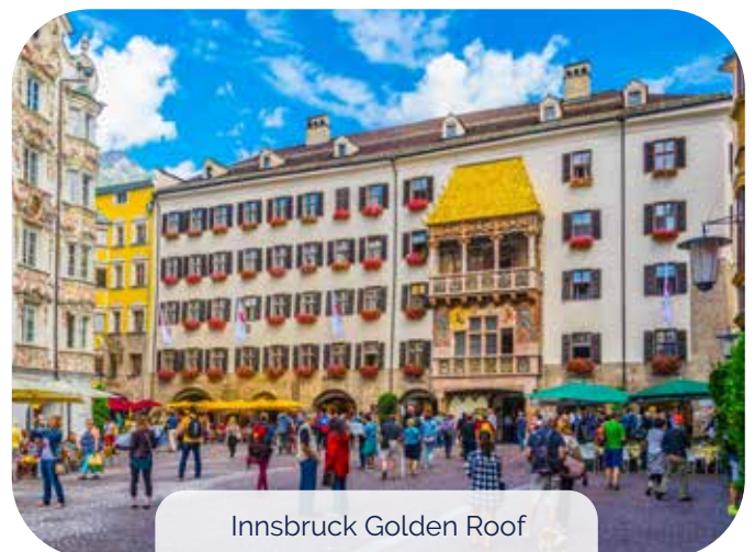
Innsbruck Golden Roof