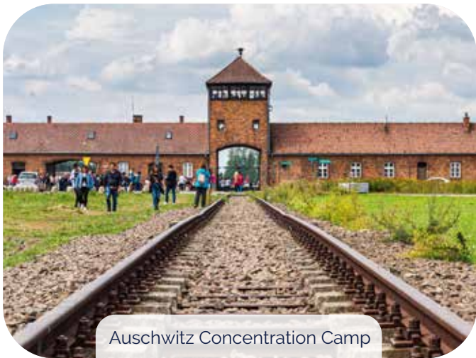
Auschwitz Concentration Camp