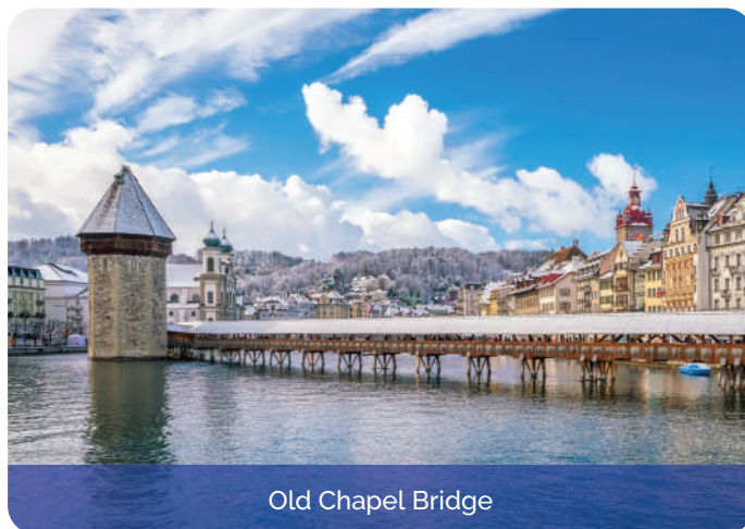
Old Chapel Bridge