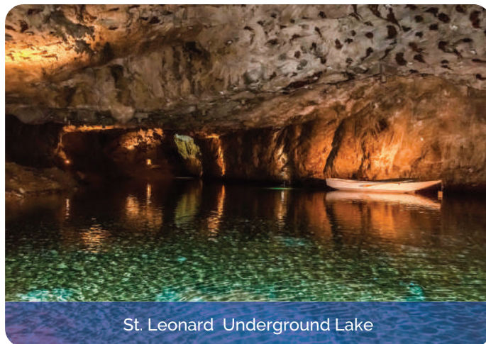
St. Leonard Underground Lake