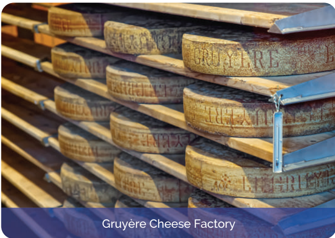
Gruyère Cheese Factory