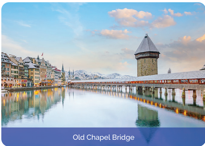
Old Chapel Bridge