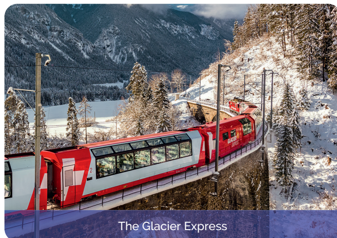
The Glacier Express