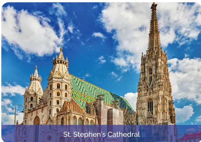
St. Stephen's Cathedral