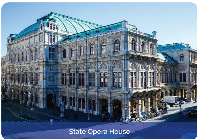
State Opera House