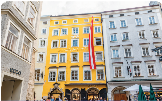
The Mozart's Birthplace, Salzburg (UNESCO)