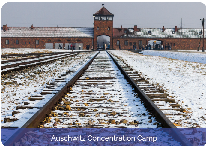
Auschwitz Concentration Camp