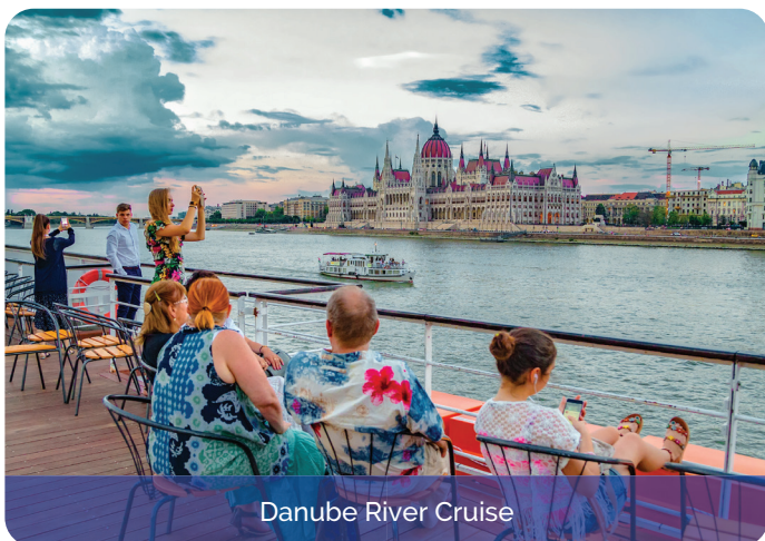
Danube River Cruise