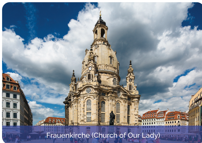
Frauenkirche (Church of Our Lady)