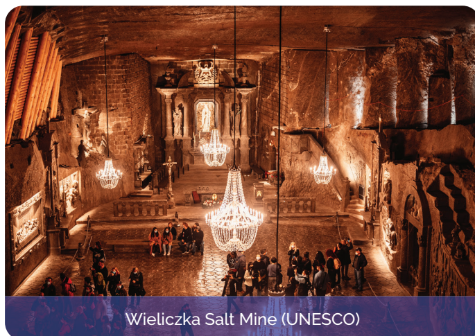
Wieliczka Salt Mine (UNESCO)