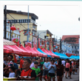
Bentong Morning Market 文冬早市