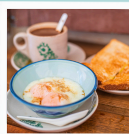
Traditional breakfast 传统早餐