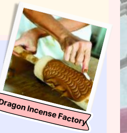
Dragon Incense Factory