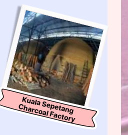
Kuala Sepetang Charcoal Factory

*Optional: Stroll to "Tong Sui Street" to enjoy the famous local desserts or visit a nearby shopping mall 可选择: 步行前往“糖水街”享用当地著名的甜品或购物商场