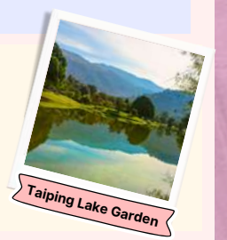
Taiping Lake Garden