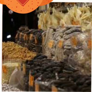
Shang Wan Hong 上环行海味专卖店