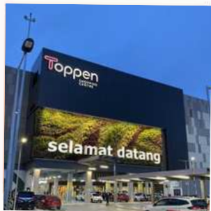
TOPPEN Shopping Centre TOPPEN购物中心