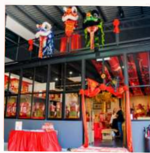
Hock Wang CNY Factory Outlet 福王年货城