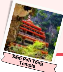
Sam Poh Tong Temple